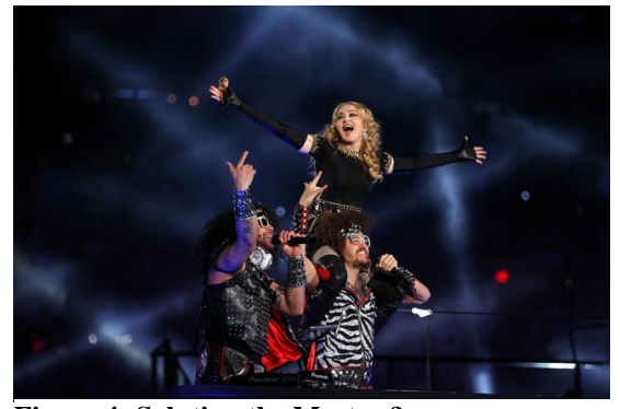
Figure 4: Saluting the Master?

lights show us a 'black sun'. The imagery here is one of sacrifice, this time it is the Woman who must die. We see a chorus in black and white, led by the Beast, now robed as a priest. Two women (one on either side of the Woman) turn away as if to show rejection as the Beast Priest steps forward (just after Madonna sings, 'and it feels like home')." Now as Madonna sings the lyrics to the final number "the light show forms a black, swirling pit (like a black hole-ABYSS) below the stage. This odd 'black hole' fans out as the choir sings (It's like a dream to me!), slowly forming the nations of the world. Madonna leaves the platform, climbing up the upstage stairs, leaving the 'Beast' in sole control of the New World Order."