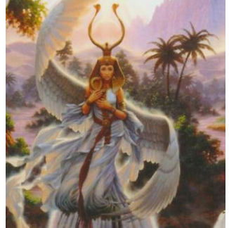
Figure 1: Madonna as Isis / Semiramis?