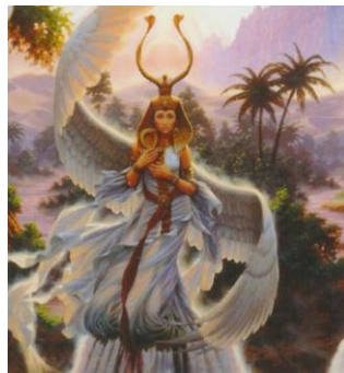
Figure 1: Madonna as Isis / Semiramis ? Figure2: Goddess Isis

is but the Egyptian form of a goddess figure which manifested herself throughout the ancient world of the Near East – and beyond to a global presence. In Babylon, where paganism reared its ugly head, she was known as Semiramis. That goddess figure gave birth to a Mother / Child cult that eventually infiltrated Christianity creating a warped version of the Virgin Mary – with almost god-like powers. 3 4